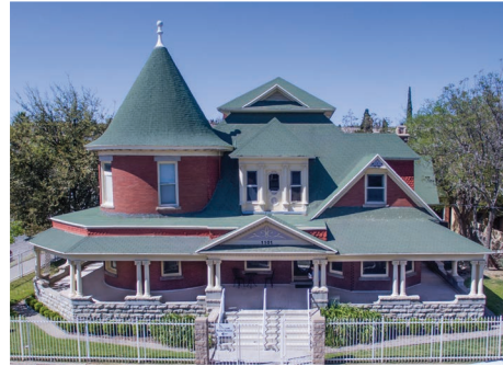
EL PASO, TEXAS 1101 MONTANA AVENUE