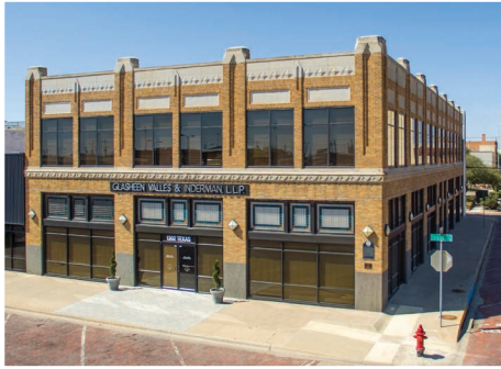
LUBBOCK, TEXAS 1302 TEXAS AVENUE

We understand that acting quickly could make or break a case. Our firm's resources allow our attorneys and investigators to be at a client's house or at an accident scene within hours, regardless of where it is in the country. With attorneys licensed to practice in Texas, New Mexico, Colorado, Oklahoma, Arizona and California our team is ready to handle any personal injury case.