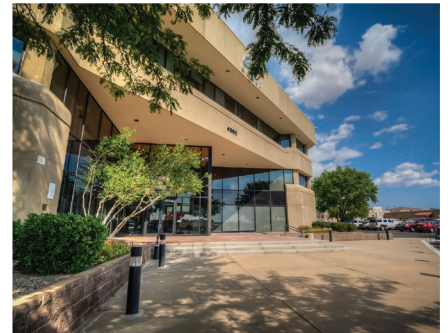
ALBUQUERQUE, NEW MEXICO 4300 SAN MATEO BLVD NE SUITE B150