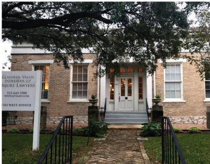
AUSTIN, TEXAS 1703 WEST AVENUE