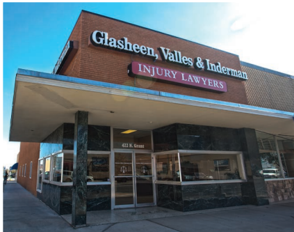
ODESSA, TEXAS 422 NORTH GRANT AVENUE